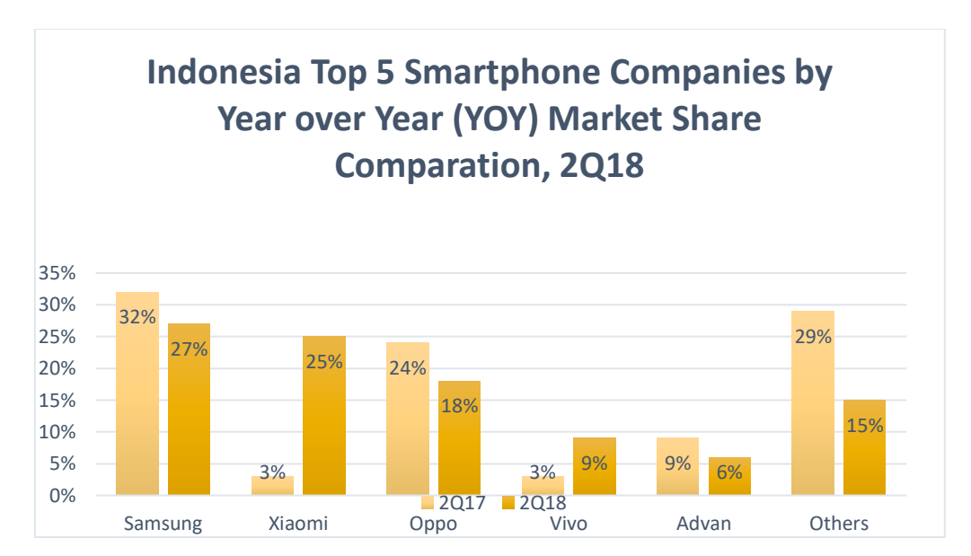
Fig. 1. Data 5 teratas perusahaan smartphone pada kuartal 2 tahun 2018

ISSN: 2597-4785 (ONLINE) ISSN: 2597-4750 (PRINTED)