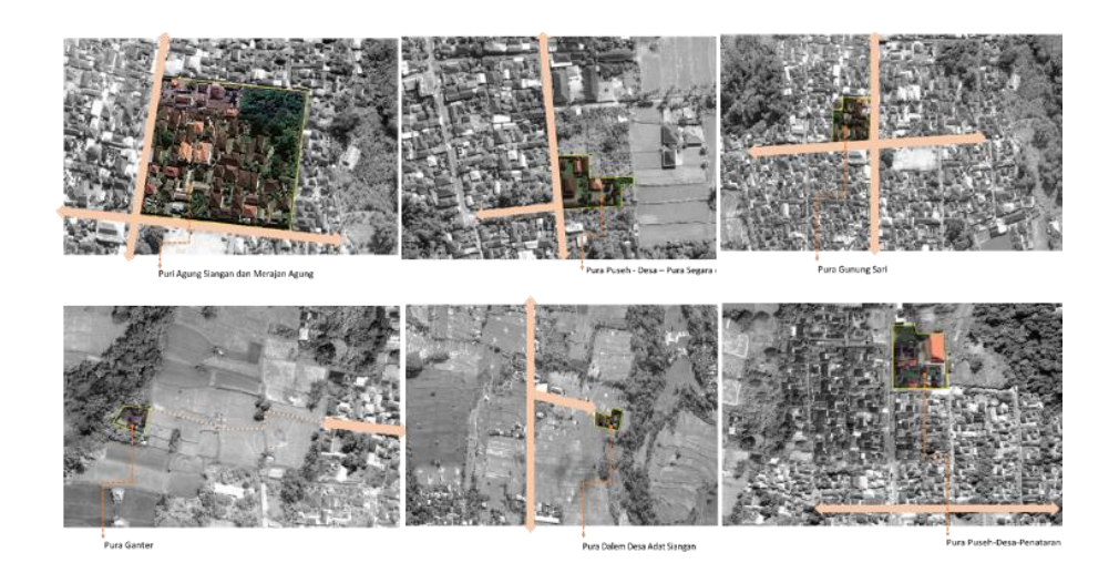
Figure 2 Cultural Heritage Map

Data collection of potential and problems was carried out by field surveys and interviews with partner groups. All important matters related to primary data will be recorded and recorded. Not to forget it is also documented as a data collection process. Here are each of the PKM locations and their activity plans.