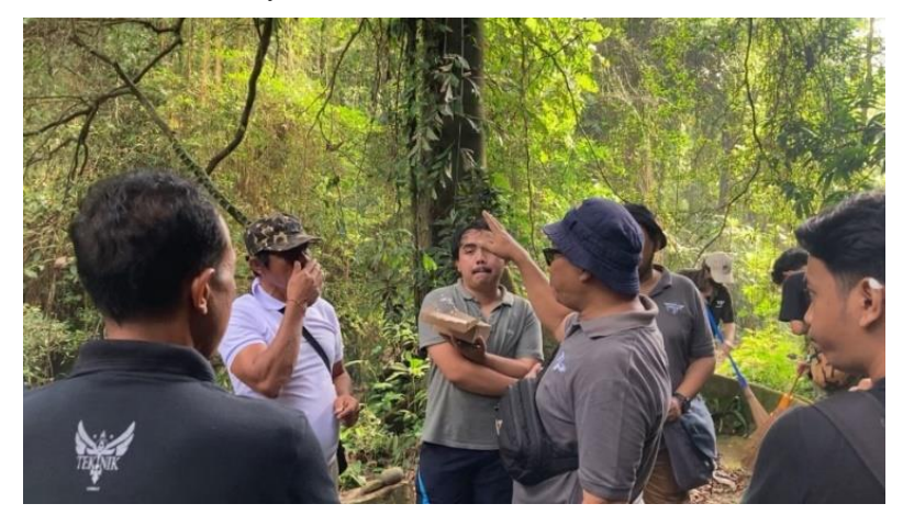
Figure 4 FGD with the Community

Socio-cultural impacts that occur from aspects of social interaction of the community in the study area as a result of the development of the tourist area of Siangan Village and its surroundings, such as interactions in religious activities, economic activities, health service activities, entertainment activities, sports activities, business cooperation, trade promotion interactions, silahturahmi, information sharing, and interaction in photo activities. Thus, the development of the tourist area of Siangan Village and its surroundings has a positive impact on the community in terms of community social interaction.