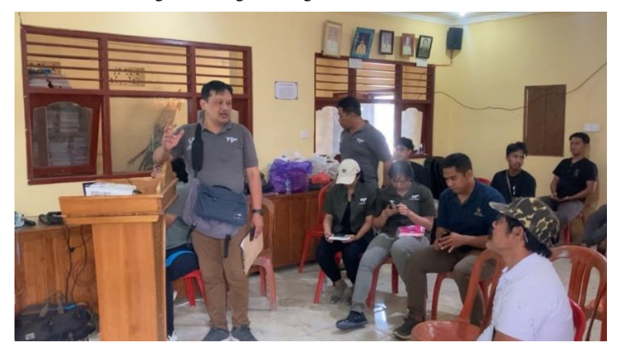
Figure 5 FGD with village officials

After the FGD obtained the results that were selected together, the next contribution was in socialization activities related to the design / idea of development in the form of Community Empowerment in the Preparation of Development Plans for Cultural Artifacts as Village Tourism in Siangan Village, Gianyar District, Gianyar Regency. This activity becomes a wider and more direct liaison with the community, especially those engaged in tourism. After the socialization of the Application of Planning Ideas, it was continued with the submission of the results of community service, namely the concept of Community Empowerment in the Preparation of Cultural Artifacts Development Plan as Village Tourism in Siangan Village, Gianyar District, Gianyar Regency, to the Bali Sentir Foundation as the manager of Siangan Village Tourism.