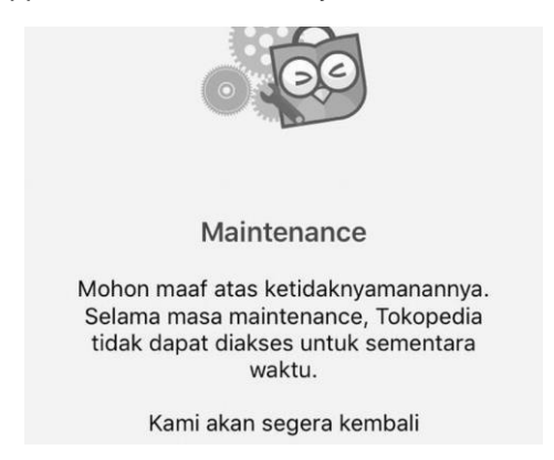
Figure 3. Tokopedia System Maintenance Notice

Based on a survey conducted by ginee.com, some of the problems that occur in Tokopedia include too frequent maintenance. In a few moments, the Tokopedia online shopping site application often experiences interference, and users who want to use this site through the Aps application often experience failed incoming connections to the site. This is due to the large number of users who are visiting the Tokopedia application or site. The crowds of visitors to the Tokopedia site itself occur due to the Flash Sale program offered by Tokopedia to consumers throughout Indonesia. At certain hours, consumers can also get surprise coupons and other promotions. In this case, Tokopedia usually notifies the user directly through the application or site used by the user.