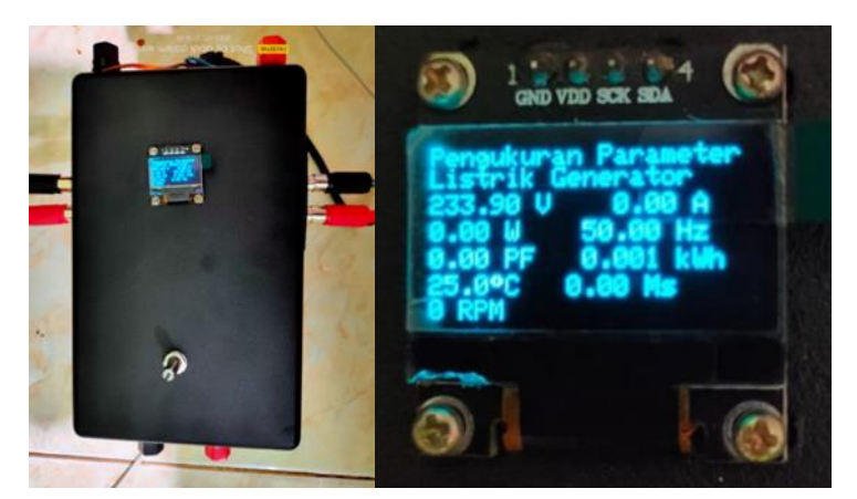
Figure 4. prototype of ship generator parameter monitoring tool