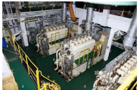
Figure 1. Main Generator(Radan, 2008)

on ships. Generators work on the principle that when the magnetic field around a conductor varies, a current is induced in the conductor. The generator consists of a set of stationary conductors wound in coils on an iron core. This is known as the stator. Rotating magnets called rotating rotors inside the stator produce a magnetic field. This field cuts through the conductor, producing an induced EMF or electro-magnetic force when the mechanical input causes the rotor to rotate.(Ma'arif, 2011)